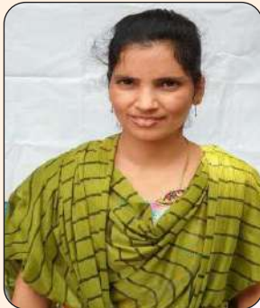
Shanthi Jute Staff