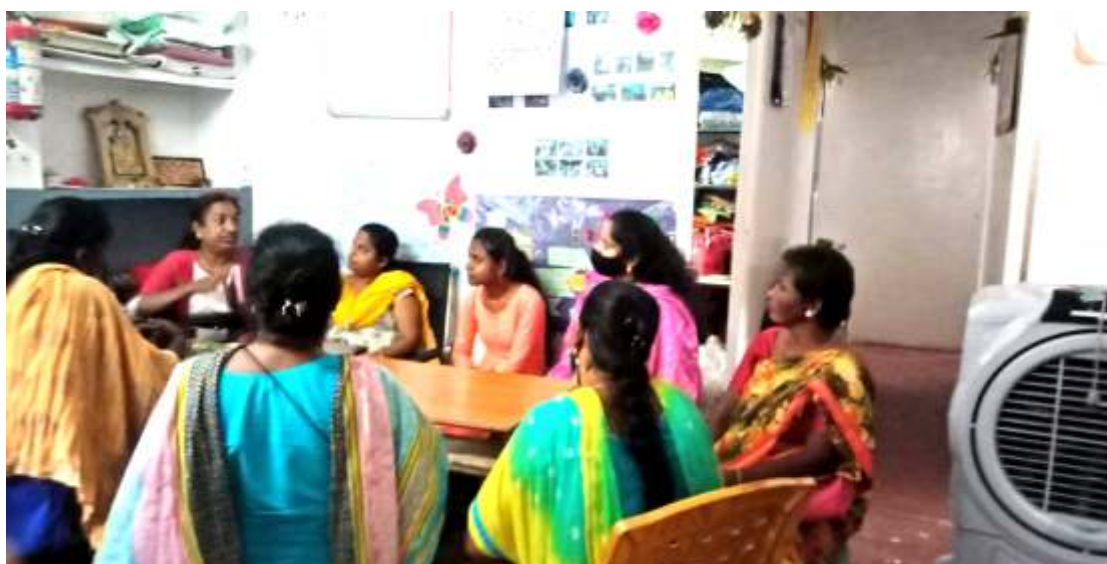
Board Members Meeting

Board Members Meeting : At Cheyutha WCBO, Board Members meet once in 3 months or as and when required to discuss the progress of the organization. Board Members along with the Senior Staff co-ordinate and take guidance of the Advisory Board Members to make sure the organization functions in a smooth way.