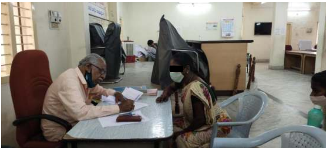
Cheyutha WCBO providing legal services

“Injustice anywhere is a threat to justice everywhere.”