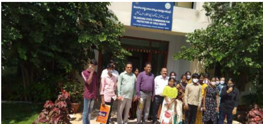
7 children whose applications for government sponsorship was approved by Women and Child Welfare Department

It was just last year we got to know that there is a provision for government sponsorship for HIV/AIDS Infected & Affected, orphan and semi-orphan children, in the age group 5-18 years. We have applied for the government sponsorship for 42 children with the "Women and Child Welfare Department" at Hyderabad and Ranga Reddy Dist. Only 7 applications have been approved so far by "Ranga Reddy Women and Child Welfare Department" and the remaining are under process. These 7 children get a sponsorship of Rs.2000/- month from Women and Child Welfare Department. 2 children who were referred by ART Centres were given admissions to government hostels.