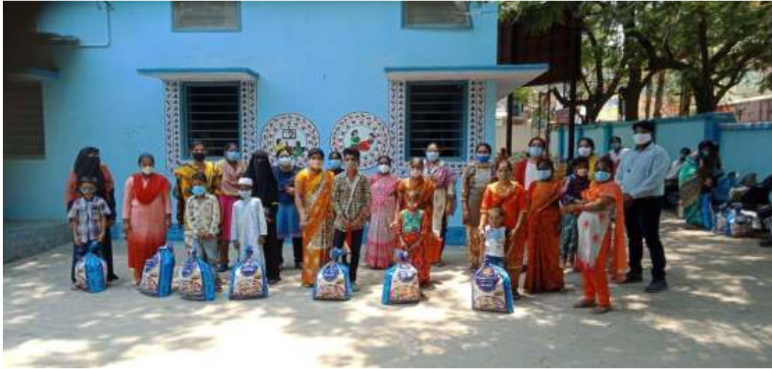
Support provided by Value Labs for 15 foster care children.