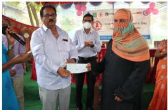
International Women's Day celebrations