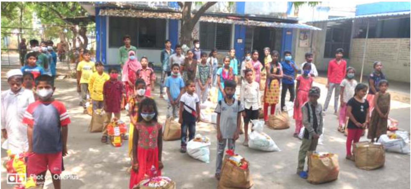
Support provided by ADP for 44 Infected/Affected children.

59 Foster care children received nutrition kits every month from APPI, ADP and Value Labs.