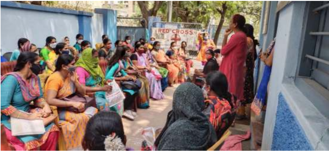
One of the Support Group meetings conducted @ Cheyutha WCBO.

While attending the support group they are provided Nutrition support (Peanuts ½ kg, jaggery ½ kg, Till ½ which will have calcium, protein, Iron) Women also motivated to save some Rs.100/- from their pension which is provided by the government widow pension and ART pension during the COVID time that saving amount helped them to pay their house rents and medical needs.