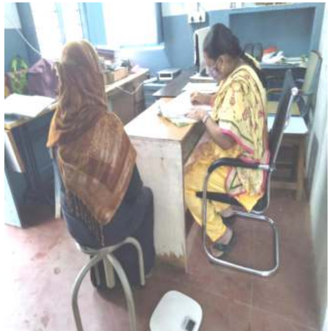
Cheyutha WCBO members receiving counselling and registration at the clinic.

Counselling is part of a holistic approach to the patient's overall health care. Cheyutha WCBO has long served as a hub for the HIV/AIDS workforce and community to come together, learn and share. We believe that right counselling gives people the information and life skills they need to make decisions about their future and proper guidance motivates people to lead a positive life. We provide different kinds of counselling like one to one counselling, Partner counselling , Family counselling , counselling during home visits.