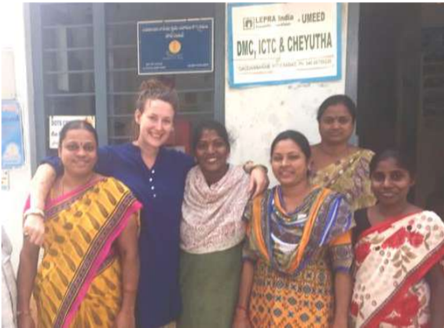
Cheyutha, Red Cross, Gaddiannaram, Hyderabad