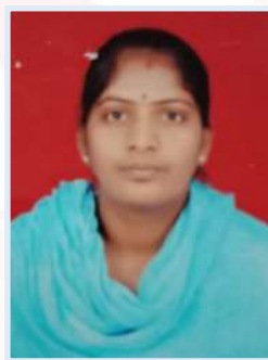
Swaroopa Jute Unit In-charge/Trainer