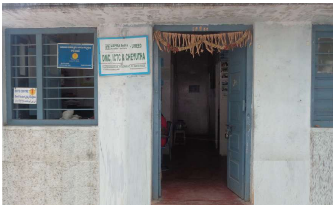
Cheyutha Office, Red Cross premises, Gaddiannaram, Hyderabad